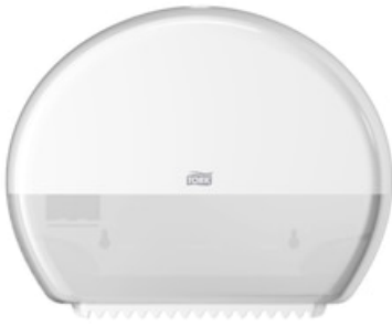
Tork Mini Jumbo Toilet Roll Disp White 555000