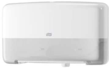
Tork Twin Mini Jumbo TR Disp White 555500

The product is made from Fresh fibres Recycled fibres Chemicals The packaging material is made from paper or plastic.