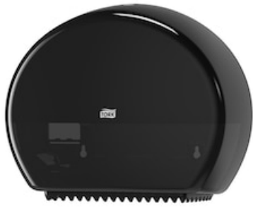
Tork Mini Jumbo Toilet Roll Disp Black 555008