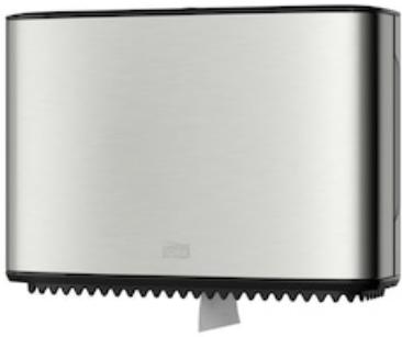
Tork Mini Jumbo Toilet Roll Disp SS 460006